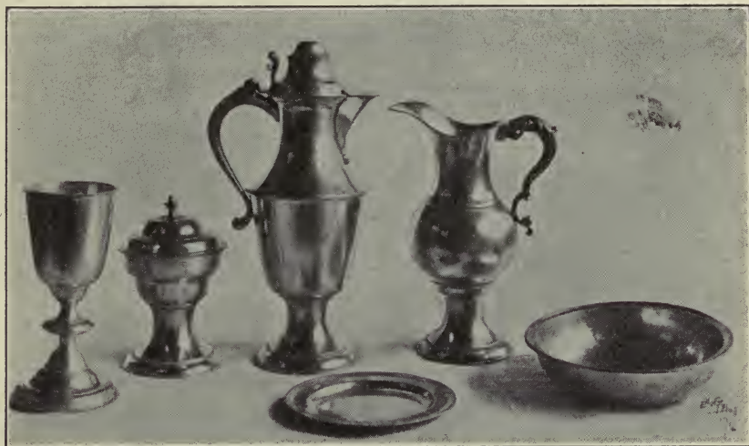
OLD ST. MICHAEL'S COMMUNION SERVICE.